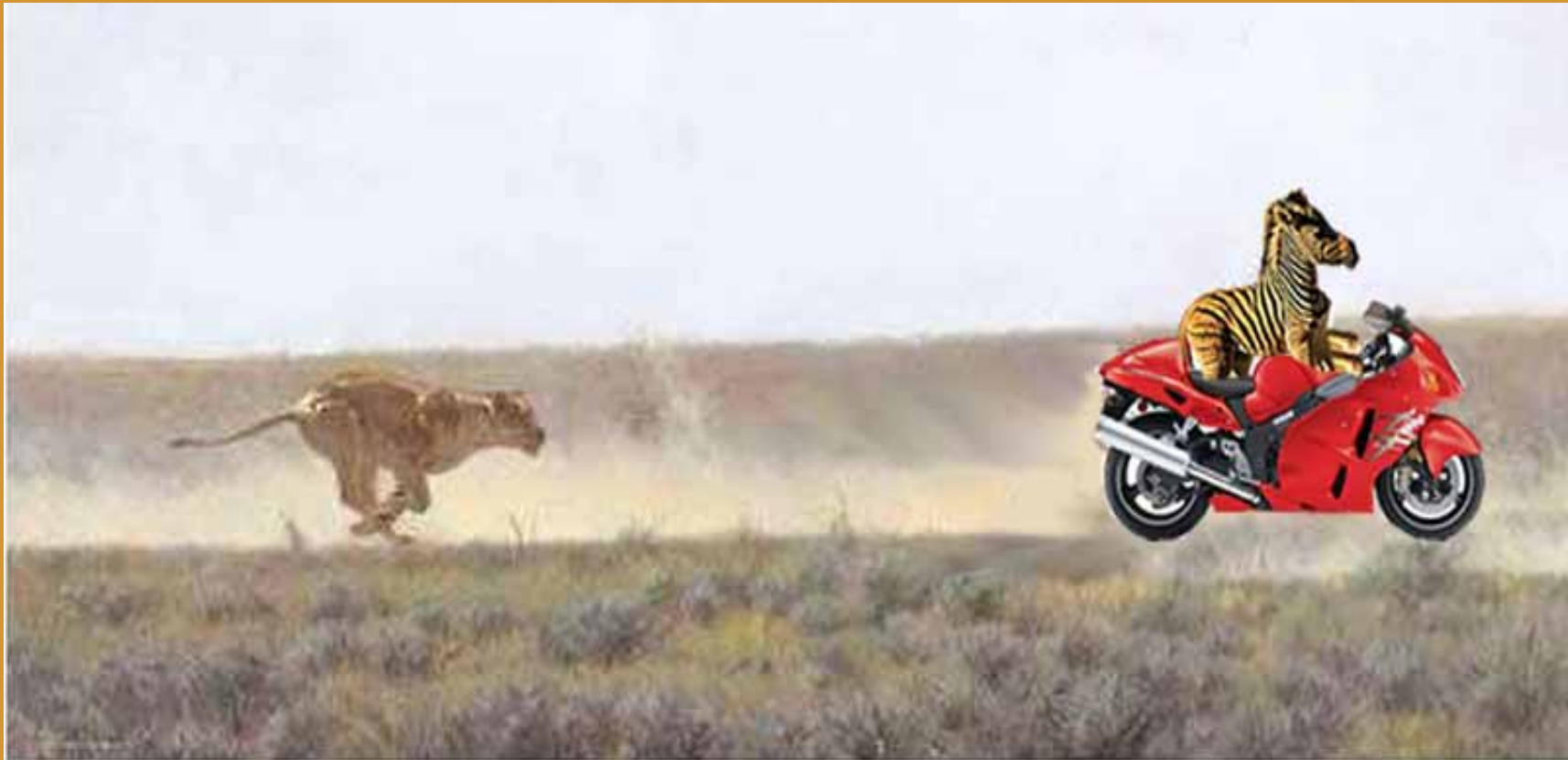
The win-win scenario